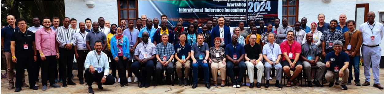
Group picture of the IRI workshop participants.