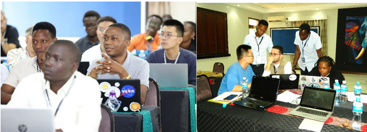
Lectures in the morning and team work in the afternoon

The two CCMC lecturers were self-payers. The airfare of one USA lecturer was funded by NASA.