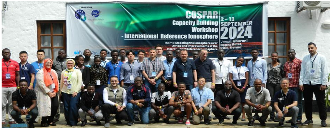
Group picture of students and lecturers

important that the hotel had promptly responding generators because there were quite a number of black-outs during talks.